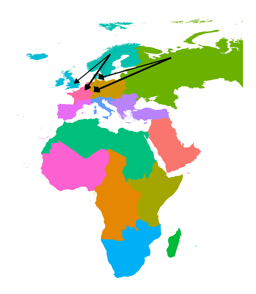
Figure 16380-6. Map showing pre-defined regions in different colours, with black arrows linking centroids of individual encounters in different regions. Arrow width is proportional to transition probability.