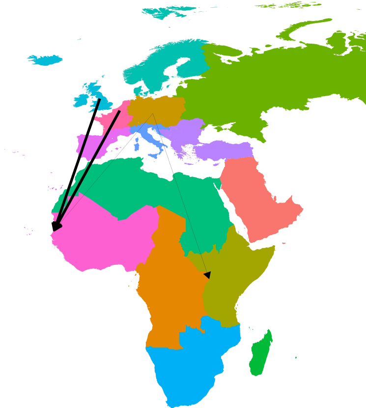
Figure 09810-6. Map showing pre-defined regions in different colours, with black arrows linking centroids of individual encounters in different regions. Arrow width is proportional to transition probability.